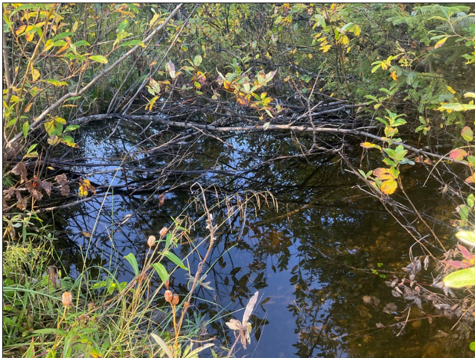
Figure 3.—Ponded water upstream of the culvert.