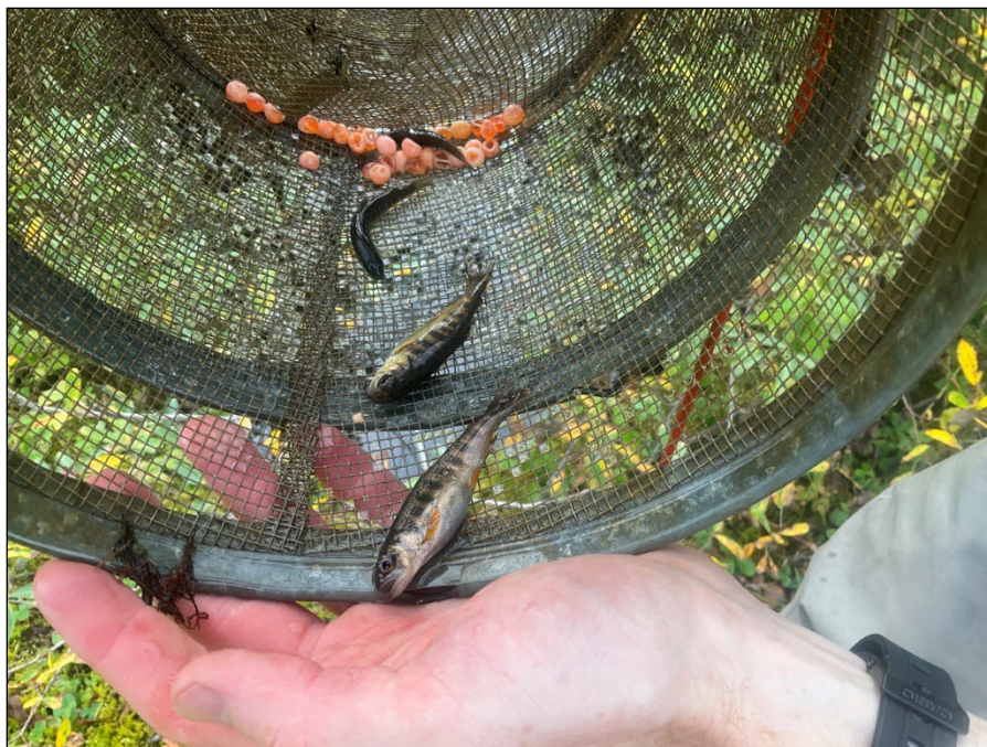
Figure 1.–Juvenile coho salmon and Dolly Varden captured at waypoint 1223.