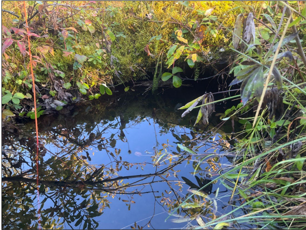
Figure 2.—Water ponded downstream of the culvert.